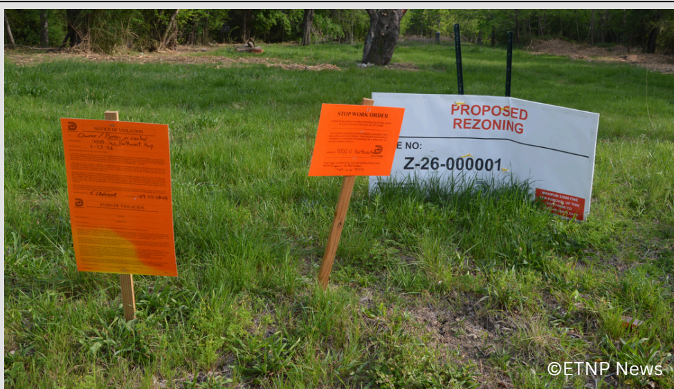
A Stop Work order is posted at the Garvin Memorial Cemetery to prevent further damage to the headstones. The Notice of Violation was for the builder's failure to get a Certificate of Appropriateness before conducting work on the site. No date has been set for the rezoning case because no site plans have been submitted as of this publication date.

A brief recap of what is at stake: Garvin Memorial Cemetery is the final resting place of freedmen who lived and died in Elm Thicket and the surrounding Freedmen Communities at the turn of the 20th century. Also interred at the cemetery are Civil War officers