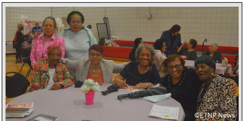
Members of the Active Senior and Adult Program and other guests are enjoying the special Mother's Day event held at the Rec Center on April 30. Thank you moms for all you do!

There was a great turnout with everyone enjoying the food, guest speaker, and festivities. Special thanks go to the Rec Center Staff and ASAP volunteers that made this year's event successful.