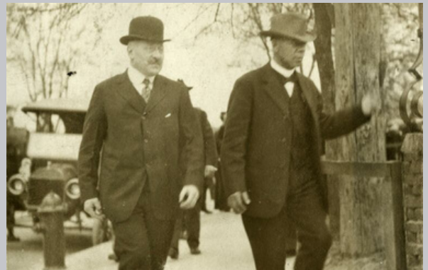
Julius Rosenwald (left) meets with Booker T. Washington (right) at Tuskegee Institute in 1915.

To attend the free program and tour the exhibit A Better Life for Their Children: Julius Rosenwald, Booker T. Washington, and the 4,978 Schools that Changed America , go to the Dallas Holocaust and Human Rights Museum website and register ( click here ).