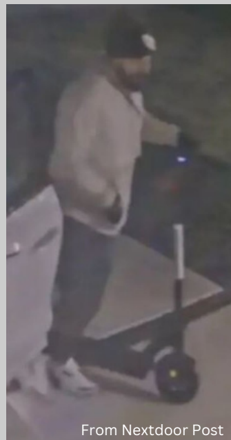
From Nextdoor Post

Many thanks to all the neighbors who are vigilant and helping to keep Elm Thicket/Northpark safe for everyone.