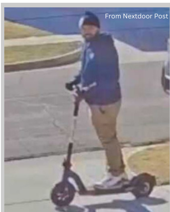
Neighbors on Cowan Ave. took pictures of this alleged thief using a scooter to make his way through the neighborhood and allegedly take items from open garages and unlocked cars.

See ETNP Neighbors Working to Stop Crime... Page 4