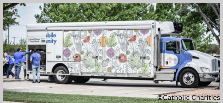
Los voluntarios ayudan a clasificar y descargar los alimentos que se distribuirán desde el K.B. Estacionamiento del Polk Rec Center.

Las fechas para la distribución de alimentos de Elm Thicket para la primera mitad del año son: viernes 7 de febrero; viernes 7 de marzo, viernes 4 de abril; viernes 2 de mayo; viernes 6 de junio. La distribución se llevará a cabo en el estacionamiento del K. B. Polk Rec Center, 6801 Roper Street.