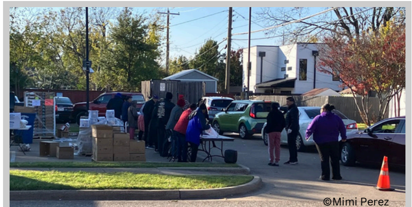
Volunteers help sort and unload food to be distributed from the K.B. Polk Rec Center parking lot.

The dates for the Elm Thicket food distribution for the first half of the year are: Friday, Feb. 7; Friday, March 7; Friday, April 4; Friday, May 2; Friday, June 6. The distribution will take place in the parking lot of the K. B. Polk Rec Center, 6801 Roper Street.