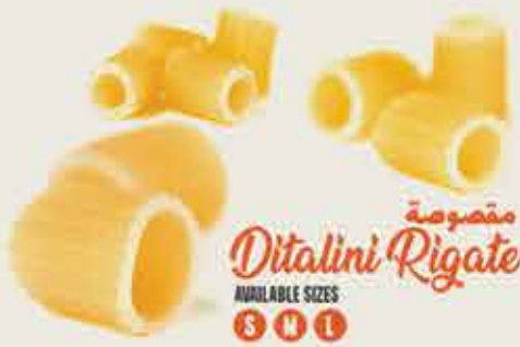
Ditalini Rigate مقصومة AVAILABLE SIZES S M L