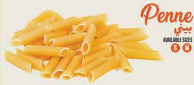
Penne بيني AVAILABLE SIZES S M