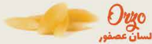
Orzo لسان عصفور