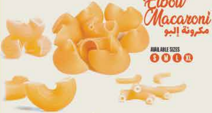
Elbow Macaroni مكرونة إلبو AVAILABLE SIZES S M L XL