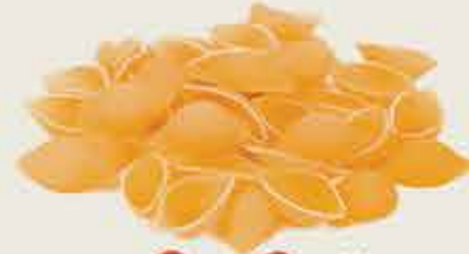
Big Shells مكرونة صدف