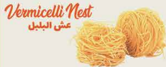
Vermicelli Nest عش البلبل