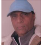
Editor / writer: Fisal Deen Ally (Brian Ally)

AI is here. AI can and will take over many jobs as the Great Reset take place where we will own nothing and be happy according to Klaus Schwab, and they will build back better. IT'S HAPPENING NOW, NOT TOMORROW, BUT NOW. How do you build back unless you first plan to destroy first? There's been a lot of manmade destruction for example Gaza and all the other places that were destroyed, to be build back into 15 minute digital imprisonment cities. Los Angeles was destroyed, to be build back better for the 2028 games with cameras and surveillance everywhere and of course AI and robots. These places are all in ruins. The Palestinians will now have no choice but to leave their historical homeland. The buildings are all falling apart, and the ones left partly standing can fall anytime.