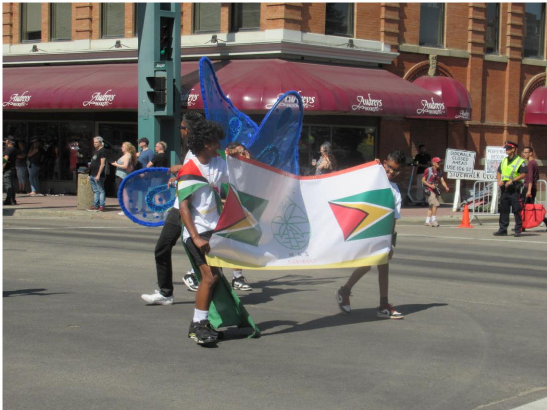
GUYANA, SOUTH AMERICA : PARADE BAND IN CARIWEST 2024