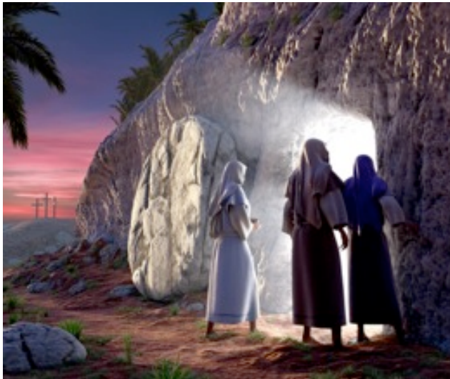
This photo is of Mary Magdalene, Mary and Salome on foot to the bright empty tomb of Jesus early on the Sunday morning.

Although practices vary, in general many Christians and Catholics across the globe have been fasting for Lent, for forty days abstaining from certain foods and habits in preparation for Easter, a time for spiritual renewal and purification, which had begun on March 1, marking Ash Wednesday and will end on April 13, 2017 for many. On Good Friday April 14, millions of Christians and Catholics will attend church.