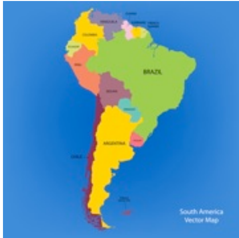
Guyana is north of Brazil, colored in pink

With Easter looming on the horizon and excitement brewing in the air, just shortly after the colorful Phagwah (Holi) celebration had rained a rainbow of colors in Guyana marking the arrival of spring, the Brazilian vaqueros cowboys and cowgirls will be entering Guyana for the Annual Guyana Rupununi Rodeo competition against the Guyanese vaqueros and cowgirls which will take place in the town of Lethem that borders Guyana and Brazil, in the Rupununi Savannah area.