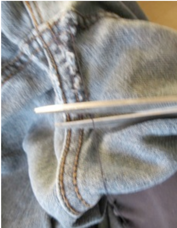
Cut the thread about 6 inches away from the pants with a scissors. Hold the two ends of the thread and tie some knots so that the thread does not get lose and gets pulled through. After tying the knots, cut away the thread from just above the knots