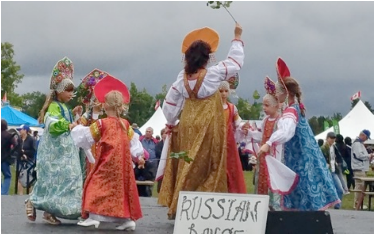
A Russian Traditional Dance Performance