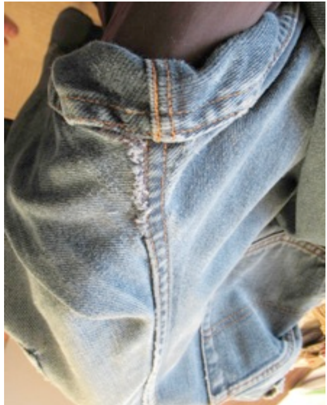
The end result. This is what the outside looks like. A sowing machine can also be used, but for simple tears, a needle and thread works great