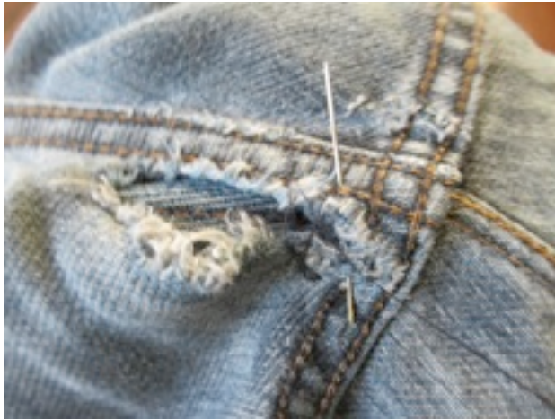
Start from one end and continue towards the other side