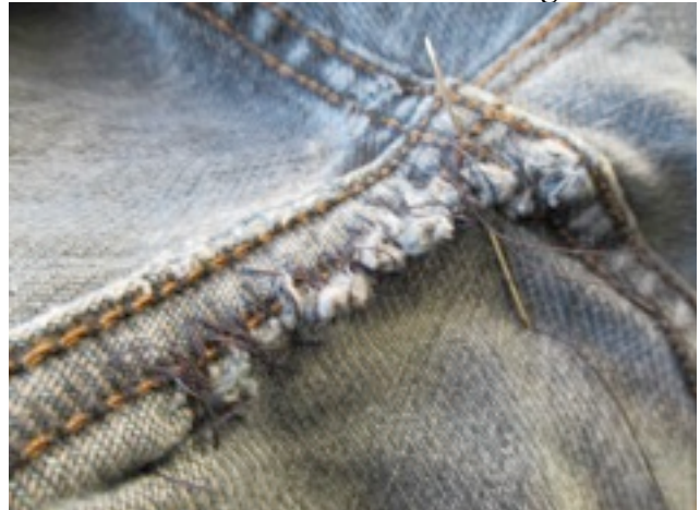
To make a stronger stitch, you can work your way back to the starting point