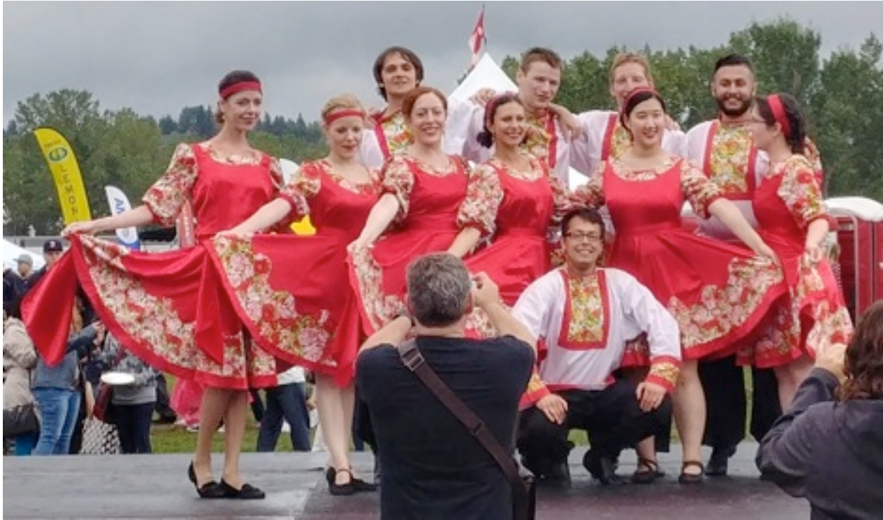
WORLD'S LARGEST MULTICULTURAL FESTIVAL EDMONTON, ALBERTA, CANADA