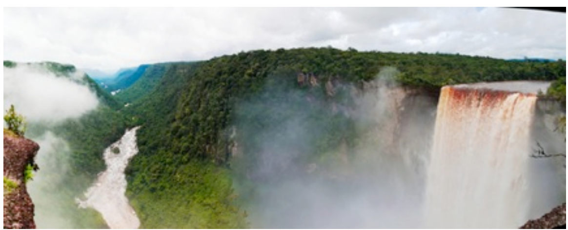
Photo of the Kaieteur Falls (Essequibo, Guyana)