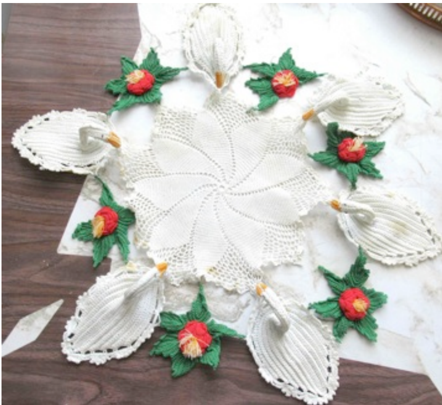
c) Hand knitted decoration of swans and flowers over 45 years ago by Naz (Neisha)

b) This purse had taken Rene 3 hours to make