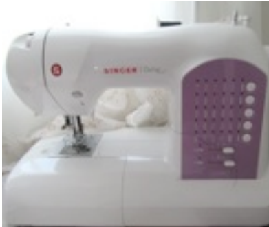
A new sowing machine used for making clothes