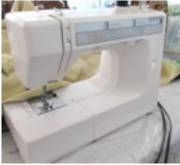
An older style sowing machine used for making clothes