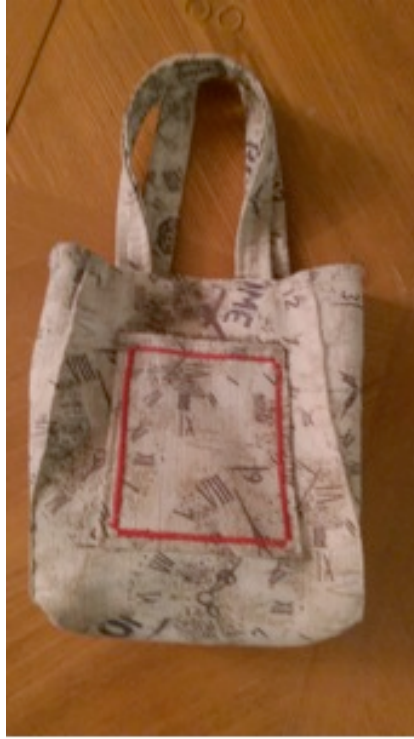
b) Purse was made by Rene.

a) Faisal's prayer coat was made from a black flexible material which does not wrinkle. It has 5 buttons. It can be taken in a car or in a bag and then put on when ready for prayers. Photo, March 27, 2018.