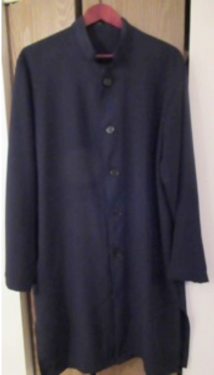
a) Prayer coat designed and sown by Faisal Ally.