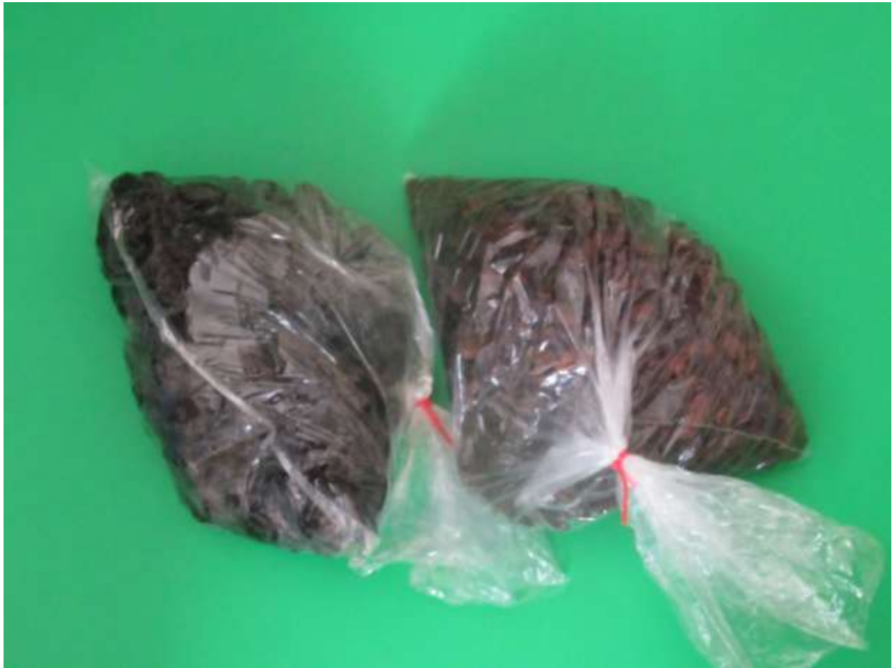
Prunes, raisins (they were out of currents)