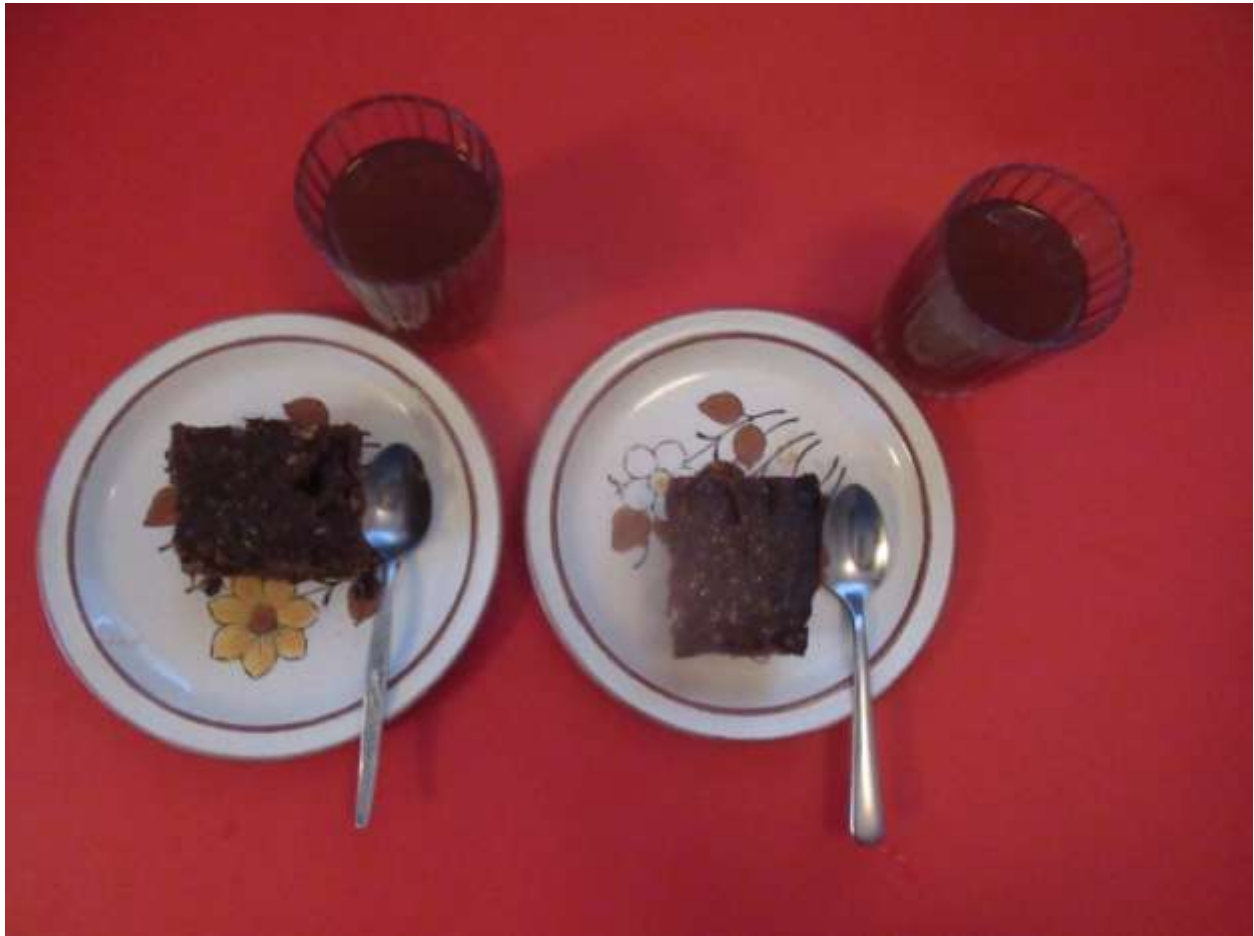
Guyanese Christmas Time Special – Black Cake & Ginger beer