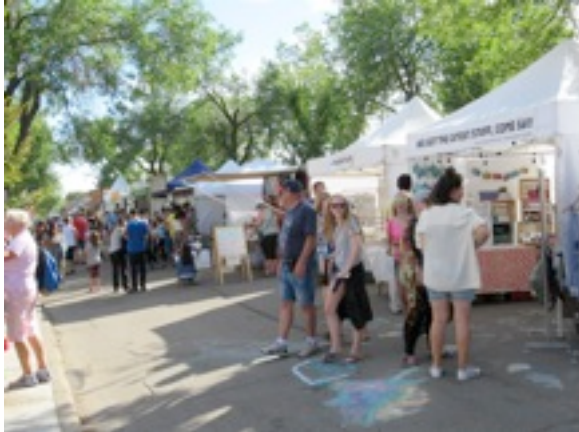
Enjoying the shows, displays, and tastes