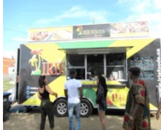
Dishes and drinks from the Caribbean