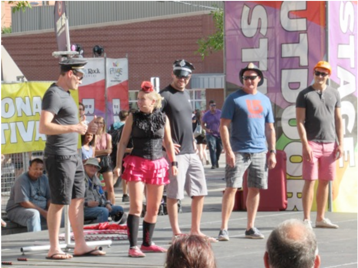
Fringe

Every summer, artists from around the globe arrives in Edmonton, Alberta, Canada at Old Strathscona just off White Avenue for the Fringe theatre festival, drawing and captivating large audiences on its outdoor and indoor stages.