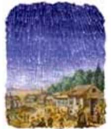
The great star shower took place on November 13, 1833.

*Peter A. Millman, "The Falling of the Stars," The Telescope , 7 (May-June, 1940) 57.