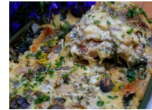
Wildest Mushroom & Spinach Lasagna With A Creamy Cheese & Spiced Mustard Sauce