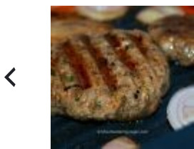
My Vegan Burger King