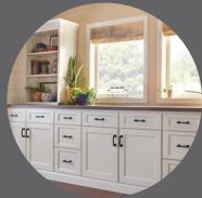
Kitchen & Bath

Find us on Instagram @wolfhomeproducts for inspiration on your next project!