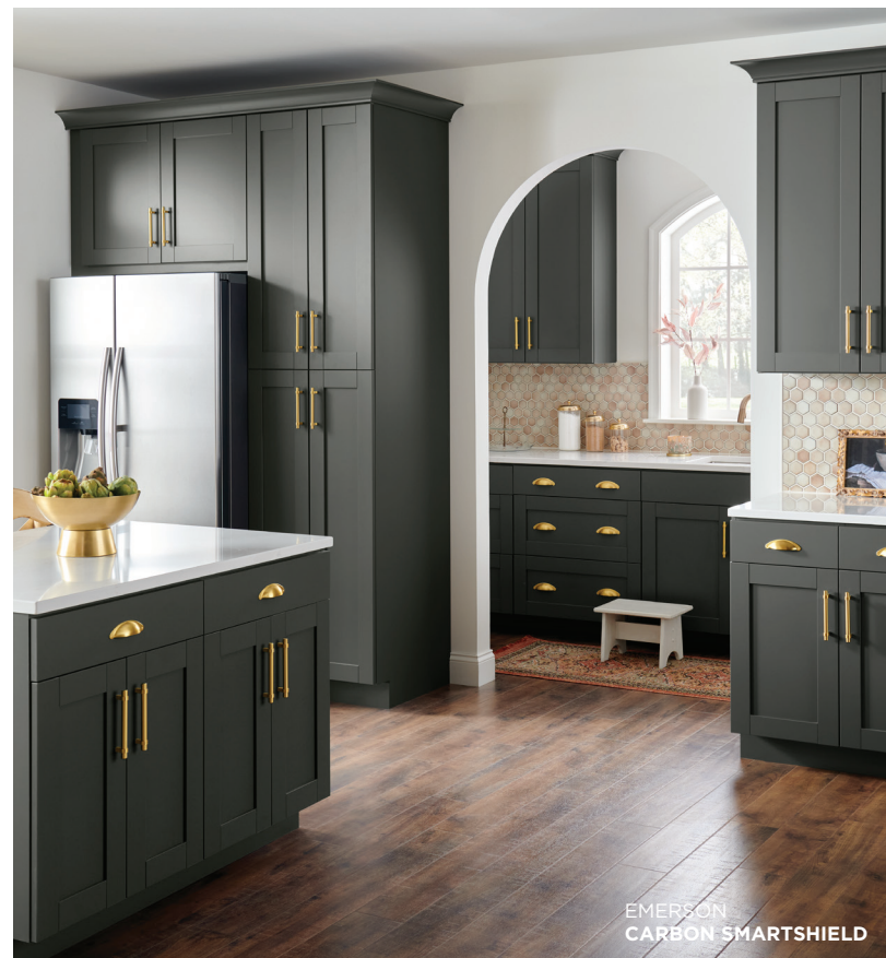
EMERSON CARBON SMARTSHIELD