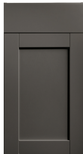
EMERSON CARBON SMARTSHIELD