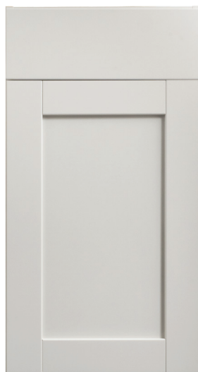
EMERSON STERLING SMARTSHIELD