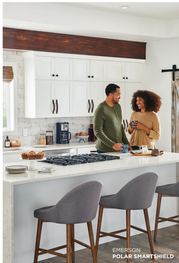
EMERSON POLAR SMARTSHIELD

The heart of the home — the kitchen. No matter the size, it's where family gathers, memories are made and with Wolf Endeavor, a space that is made for everyday life. Wolf Endeavor cabinets feature our SmartShield™ Technology that give you an ultra-durable finish that stands up to whatever life throws its way. Available in a modern, shaker-style door in an attractive, neutral palette, Wolf Endeavor brings together all the right things — style, function and beauty — all at the right price.