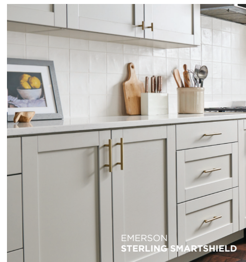
EMERSON STERLING SMARTSHIELD