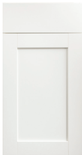
EMERSON POLAR SMARTSHIELD