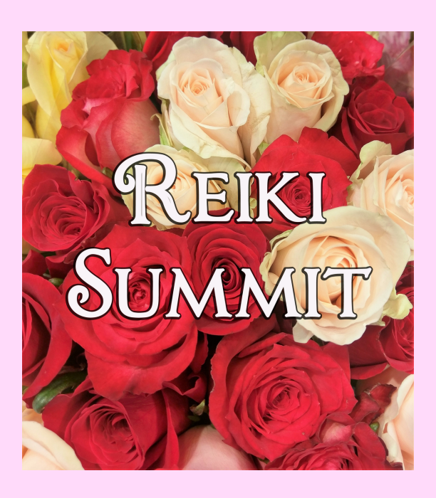
Reiki Summit with Exclusive Video!