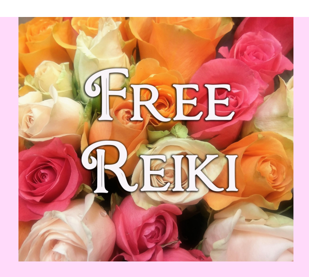
Free Reiki for Better Health!*

To receive the Reiki on Sunday, September 30th at 8:00pm EST, please send me an email with the subject line Free Reiki for Better Health to this address: restrelaxationreiki@gmail.com.