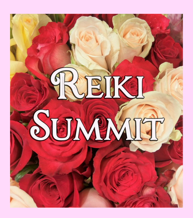
Reiki Summit with Exclusive Video!

This year I am participating in Reiki Ray's Fall 2018 Reiki Healing Summit! Will be offering a free exclusive Reiki video on childhood trauma . The summit is free to attend, and you can sign up for it at the button below.