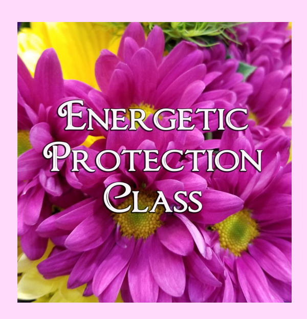
Energy Protection Class

Very happy to be offering my first interactive class on Energetic Protection this Saturday! This semi-private interactive class will be for a small group of 6-8 people. The interactive class is hosted through Zoom Meetings; you will be able to see, hear and speak with me, just as I will be able to see,