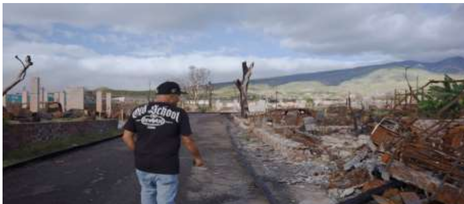
Scene of destruction in Maui

MAUI, HAWAII: The Hawaiian town of Lahaina experienced the deadliest U.S. wildfire in more than a century in August 2023 , which killed 102 people, left 13,000 homeless, destroyed 2,000 buildings and turned the town into ashes. The goal of the recovery effort "is to restore hope for survivors of disaster by recruiting, organizing and empowering volunteers to repair and rebuild homes impacted by the disaster.in " Teams have been working diligently since the disaster and are focused on new construction for homes.