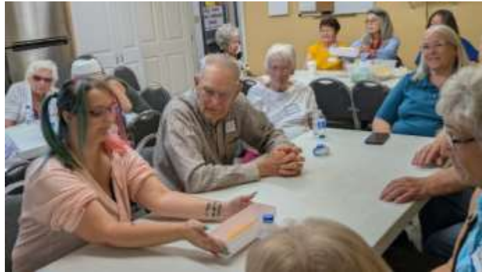
At game time, we had a blast getting to know lots of new things about each other.