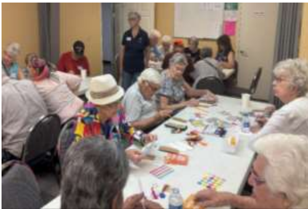
Participants made bookmarks, beaded bracelets and pencil pouches to be given to children in need.