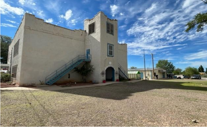
St. Joseph's Mission School, San Fidel, NM

During the month of July, High Desert UMC collected school supplies for the teachers of our church family to use in their classrooms, plus art supplies to be sent to St. Joseph's Mission School. Remaining supplies are to be made available to the clients of the High Desert Food Pantry.