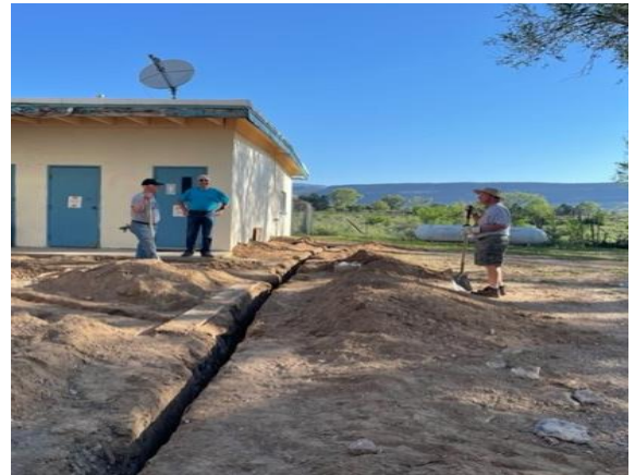
Just a portion of the water line behind the school, to illustrate the length of the project