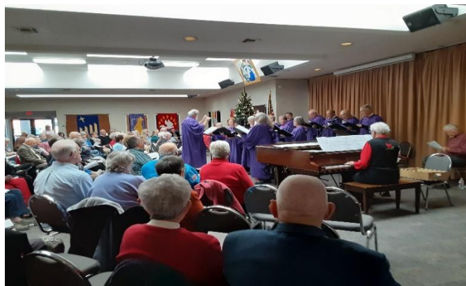
Christmas Eve Service at HDUMC