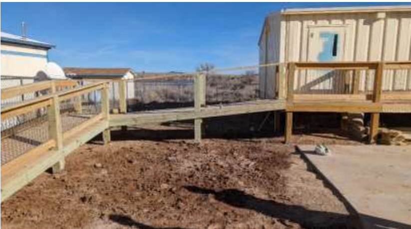
Part of the almost- finished deck and ramp