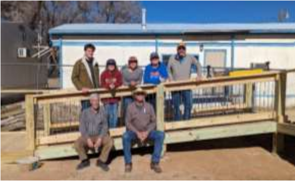
Some of the team with Elon University students

Over several days during January a hard-working team of guys from High Desert UMC spent many long hours constructing a ramp to the deck that was built last summer between two portable