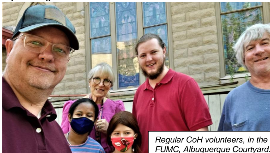
Regular CoH volunteers, in the FUMC, Albuquerque Courtyard.

Community of Hope thanks High Desert UMC for partnering with us in providing Sunday lunches. We know CoH has created mutual ministry for us to come together as we love God and love our neighbors. "We're just doing what Jesus wanted His Church to do."