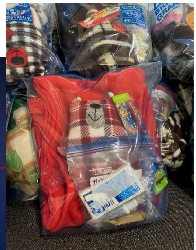
Completed “Bear and Blanket Kits”