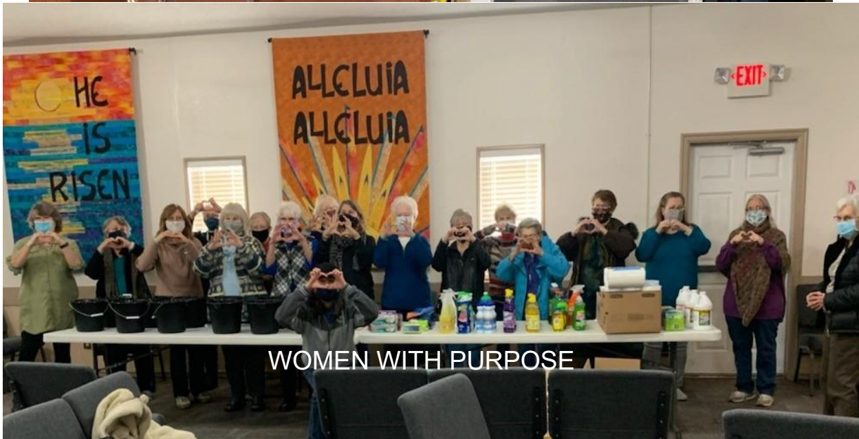
WOMEN WITH PURPOSE