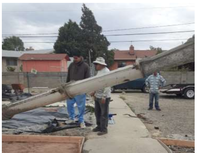
Gordon instructing concrete helpers from the Nazarene Church