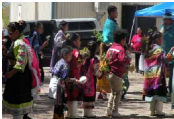
Young Dancers in their Native Dress on Feast Day