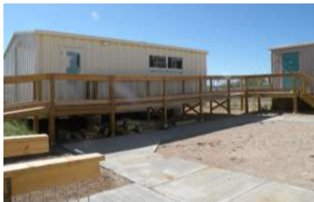
Sidewalk & Deck at St. Joseph's