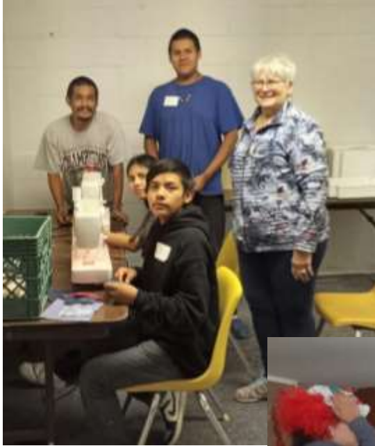
Lorraine's Sewing Class: a girl, 2 boys, and a dad!