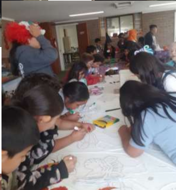
Children's Halloween Party