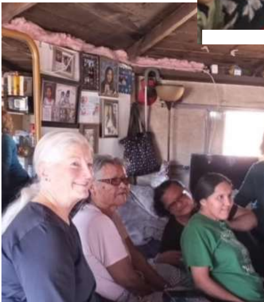
Wanda W-J visiting a sick lady