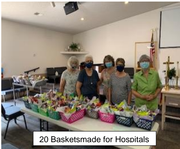
20 Baskets made for Hospitals