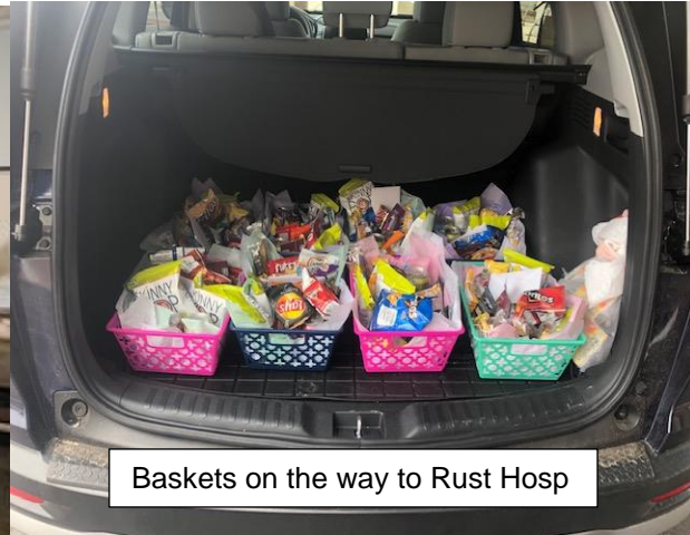
Baskets on the way to Rust Hosp