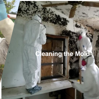
Cleaning the Mold