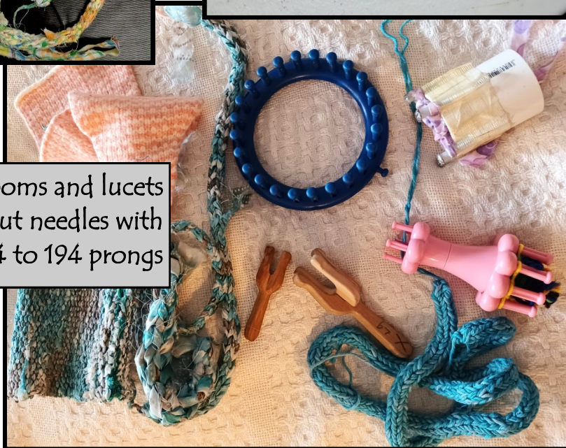
Knitting looms and lucets Knitting without needles with 4 to 194 prongs