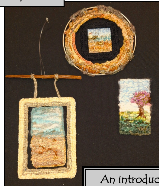
An introduction to textiles and needlework for young and old, individually or in group projects