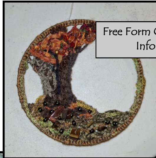
Free Form Crochet tapestry Informed by Nature