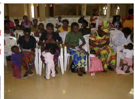
ABOVE YOUNG MOTHERS PREACHED TO AT RESTORATION AND IN TEXT BOOKS DONATION TO THE CHURCH RECEIVED BY ONE OF THE PASTOR'S WIFE