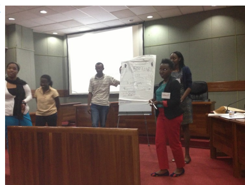
The delegates at BDC sessions making a presentation about advertising.

The BDC program is not just for Kigali another session is starting in Uganda Kampala so if you can, its an opportunity to see two countries, the flight is the same as there is a stopover by most airline. Let me know, all experiences are welcomed