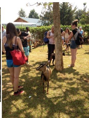
Some of the group from Scotland at Ben's house where we had dinner. The group before distributing their goats.