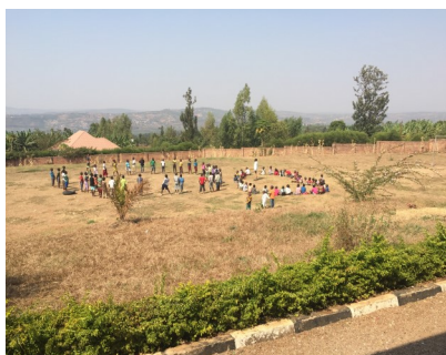
Children at youth camp