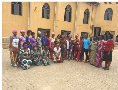
The women at Restoration church after the married women's seminar

Second half of the day was spent in another Restoration branch and this time I spoke on "being made in God's Image and being creative" This was a workshop for some women I met last year. Last year I made them set up a puzzle board and this year to illustrate being creative I made them paint what came to their mind once they prayed. I took some oil paint and paper, and brushes. It was fun, they loved it and we loved it. At the end, each group presented their piece and we prayed over it. Some came up with business ideas of shop, school, some came up with their dream home of happy family. It was such a wonderful evening for everyone. I was just as surprised as they were to see what God can do when you let go. I learnt this from my trip to US at Global Awakening and I have to say it really made a huge difference. Pictures does speak louder than words. Thank you Jesus.