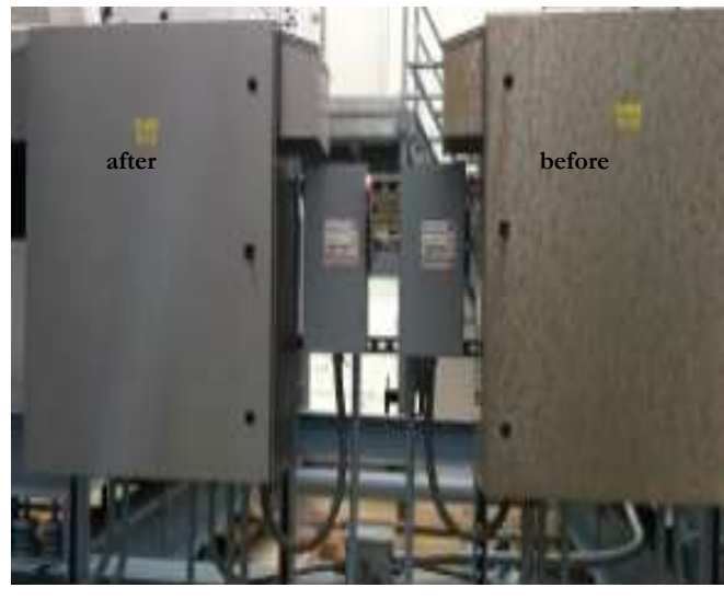
Moana Pacific Roof Top Stainless Steel Control Cabinets

Enviroklean can be used on almost all metals including stainless and aluminum. Enviroklean can dull some aluminum—this can be polished out.