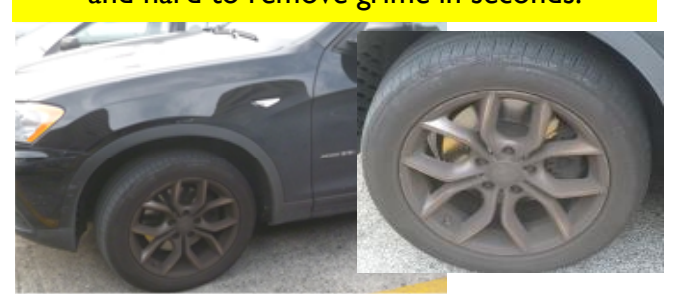
Before —Clean car Unsightly BRAKE DUST

Enviroklean® Multi-Purpose Cleaner removes brake dust!* So simple—melts away all that unsightly and hard to remove grime in seconds.