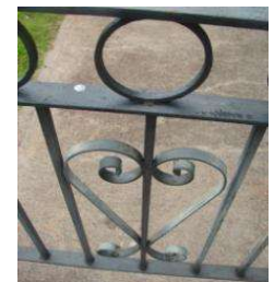
Protected with CP90