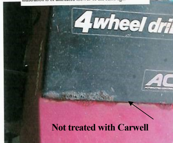
Not treated with Carwell

Upper illustration of CarWell CP-90 treated mower. Lower illustration is of untreated mower of the same age.