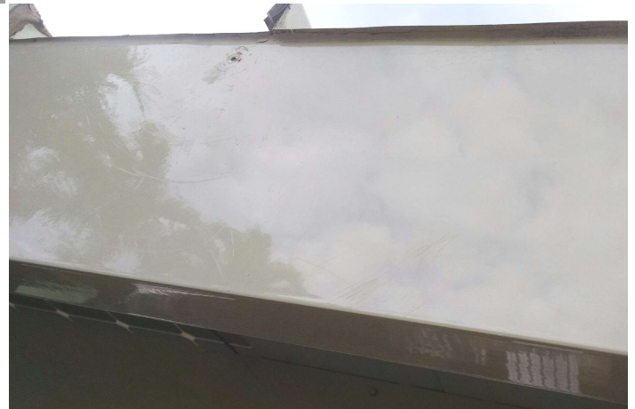
After—easily removed all rust staining with no damage to carport surface