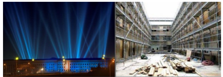
World's largest building Pentagon in Washington DC under repair using Cortec MCI® - 2020.

MCI® 2020 was chosen for renovation of Pentagon and has won International Concrete Repair Institute Award for the best repair project. Corrosion of embedded reinforcing steel was causing spalling on the walls of Pentagon. Carbonation on the walls lowered the pH of the concrete causing the corrosion. The requirements included: a minimum 20 year design life, stop water absorption, reduce or stop corrosion, and maintain the appearance of the walls. The repair program consisted of 18600 m 2 (200,000 ft 2 ) of surface hand patch repair and over 92903 m 2 (1,000,000 ft 2 ) treated with MCI® 2020 V/O, and a silicate based coating. MCI® 2020 V/O was chosen to protect and repair the walls based on its warranty and its fulfillment of the other specified repair design requirements. MCI® 2020 enabled Pentagon building premium repair, rehabilitation, and protection for the next 50 years.