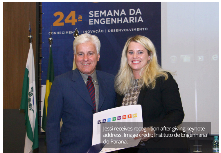
Jessi receives recognition after giving keynote address.