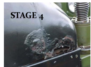
Stage 4 looks like Swiss cheese condition, many holes, heavy scale similar to stacked Maui chips and loss of 50% or more of original metal.

Preventative maintenance to stay in stage 1.