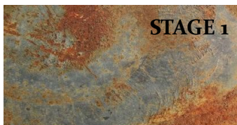
Stage 1 - Earliest signs of corrosion.

The stages of corrosion are stage 1 to stage 4