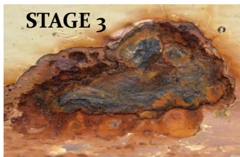
Stage 3 corrosion is found with heavy scale and minor edge erosion.