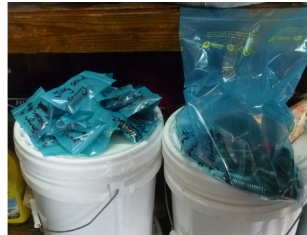
All Protected – with Cortec VpCI film