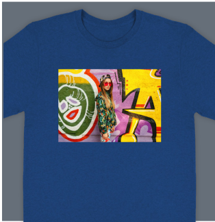
Produced with: LASER-1-OPAQUE®

LASER-1-OPAQUE® Heat Transfer Paper is easy to use for transferring laser photo-quality images or other graphics to dark colored materials, offering a soft, supple transferred image that is vibrant and durable – and will withstand many laundry cycles, regardless of the model of laser printer or copier.