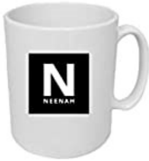
Produced with: TECHNI-PRINT® HS

MUG'S N MORE is designed for use on hard surfaces including mugs, cups, tiles and other glass, ceramic, wood or metal surfaces