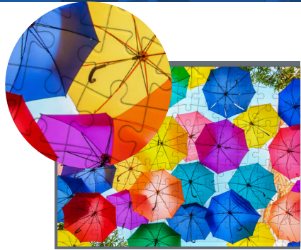
Produced with: TECHNI-PRINT® EZP

TECHNI-PRINT® EZP Heat Transfer Paper is for transferring photos and graphics to white and light colored fabrics, is easy to use yet gives crisp vibrant images regardless of the model of the laser printer or copier. Also Indigo® certified for the 7000 – 1000 series of printers.