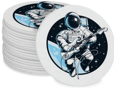
Produced with: TECHNI-PRINT® HS

TECHNI-PRINT® HS Heat Transfer Paper can be run on oil or oil-less laser printers and copiers. Please review and consider the instructions as a “starting point” given the wide range of materials that are compatible with TECHNI-PRINT® HS Paper.