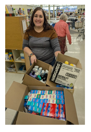
We received a generous donation of toothpaste. Thank you!

Lincoln 3rd ward donated hygiene kit items and then assembled them at the Center.