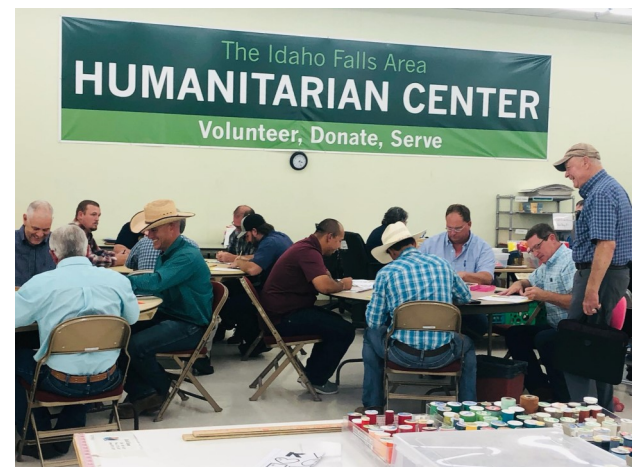
C-A-L Ranch managers hard at work at various service areas throughout the center during night of service.