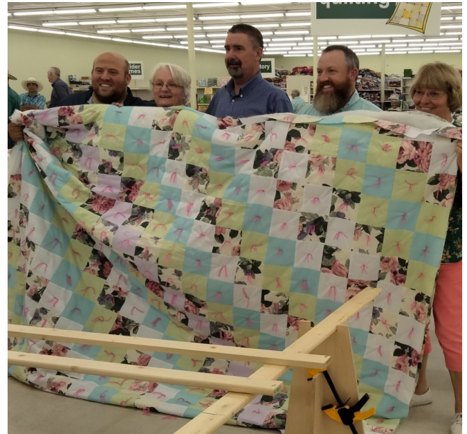
Three proud C-A-L Ranch managers display their completed handiwork during September C-A-L Ranch night of service.

gether that they insisted on being photographed with their handiwork. At the end of the evening, the Center received a generous corporate C-A-L Ranch donation.