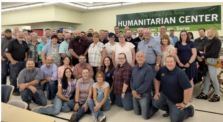
Sixty-five C-A-L Ranch managers from four states participate in a night of service at the IFAHC in September.