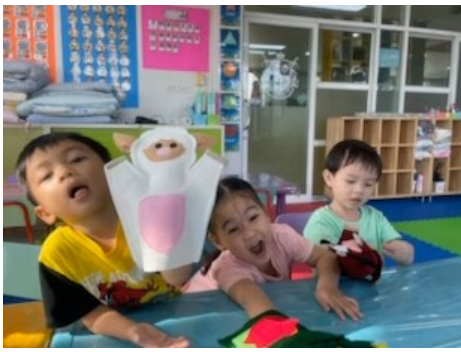
Kids from Thailand receiving and playing with their new puppet friends!