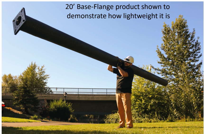
20' Base-Flange product shown to demonstrate how lightweight it is

EasyStreet Systems, Inc. 6021 E. Mansfield Ave. Spokane, WA 99212 easystreetsystems.com