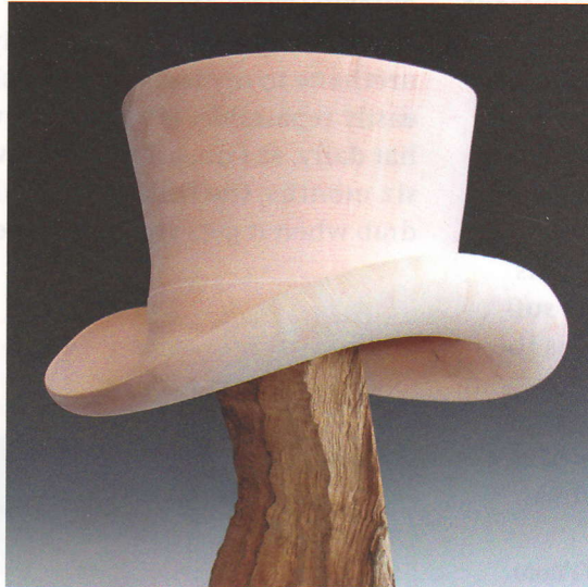
(Right) Top Hat, 2009, Bleached curly sugar maple