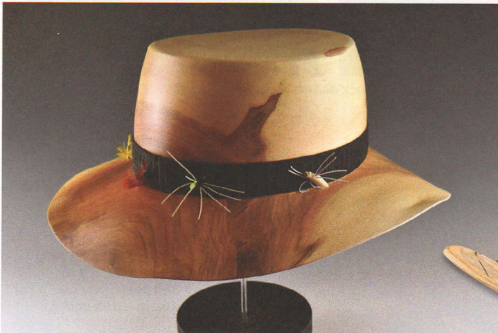
Fisherman's Hat, 2020, Ambrosia maple