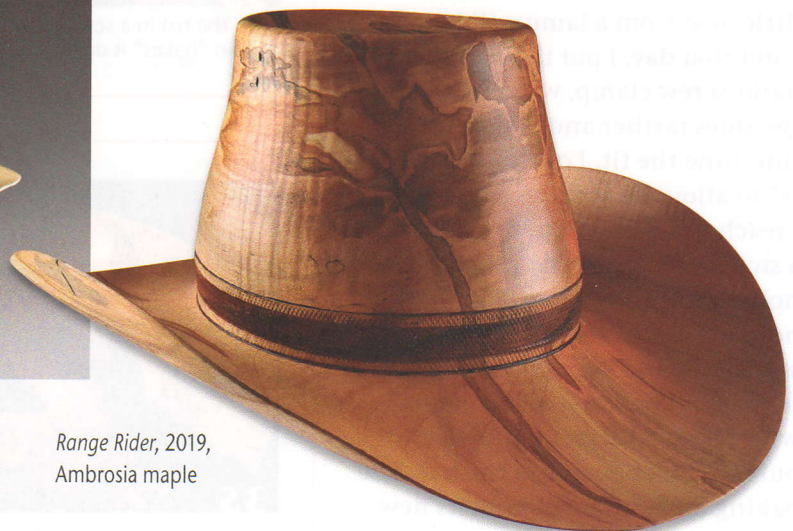
Range Rider, 2019, Ambrosia maple