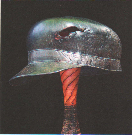
(Left) Carnaby Cap, 2001, Ebonized madrone burl