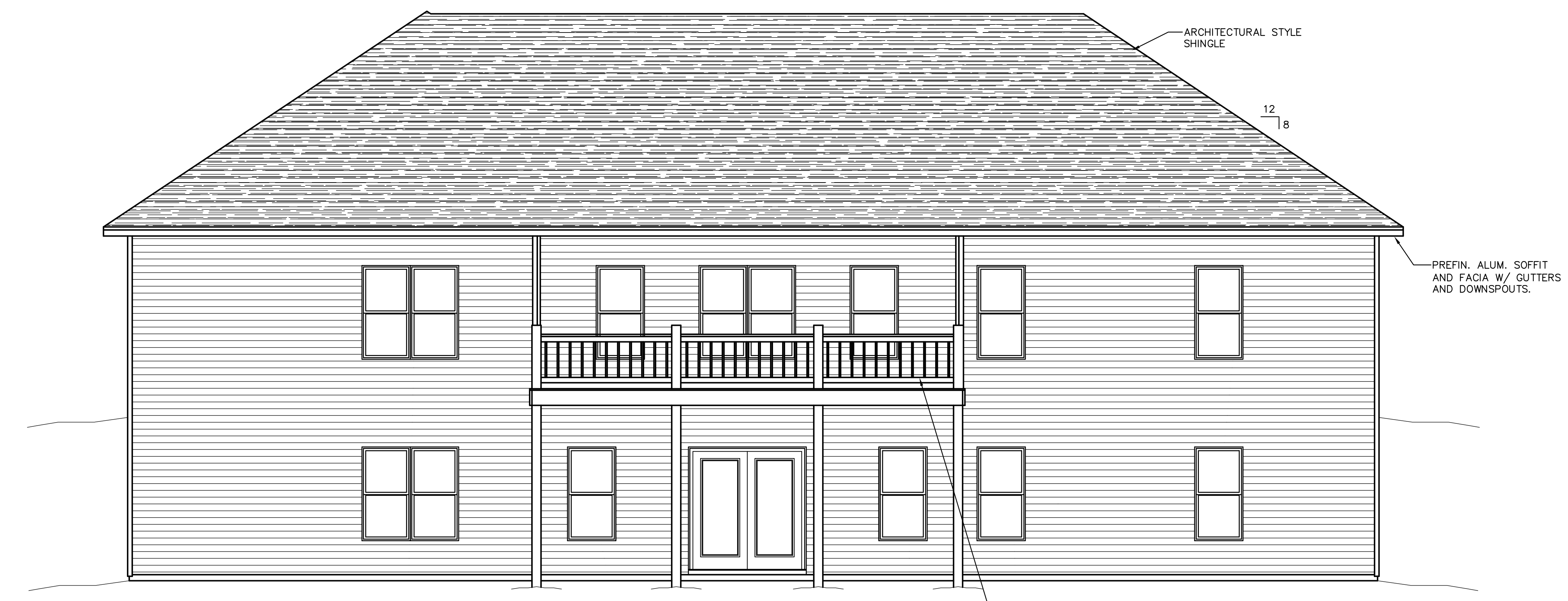
Back Elevations SCALE: 1/4" = 1'-0"