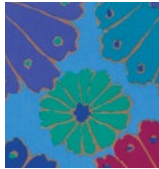
Backing 108" (274.32cm)

44" (111.76cm) 5¼ yards (4.80m) OR 108" (274.32cm) Carpet Blue QBGP001.BLUEX 2¼ yards (2.06m)